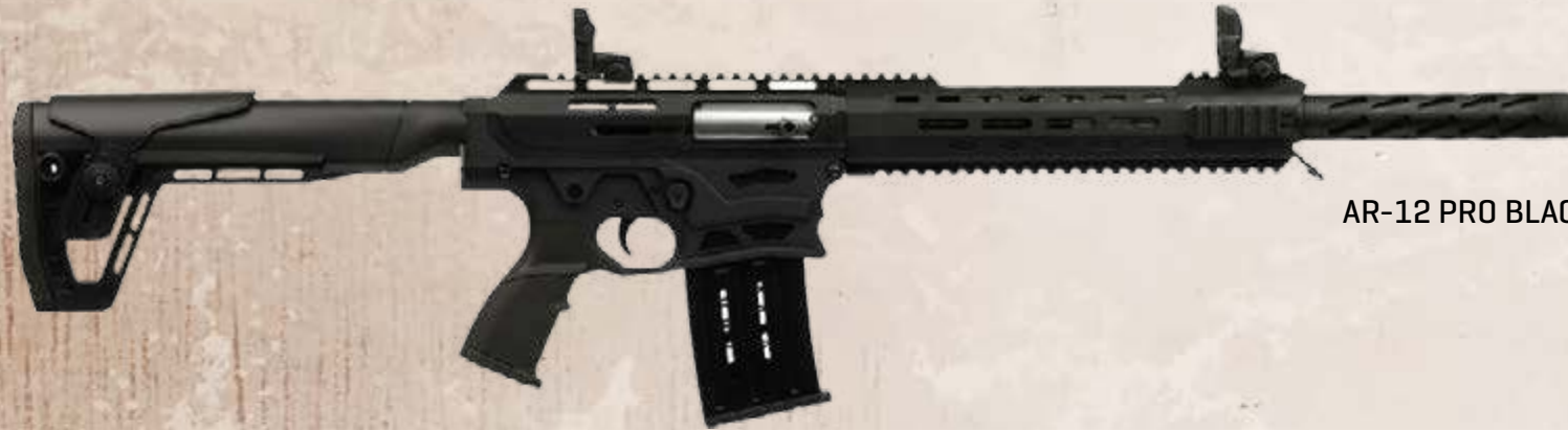
AR-12 PRO BLACK