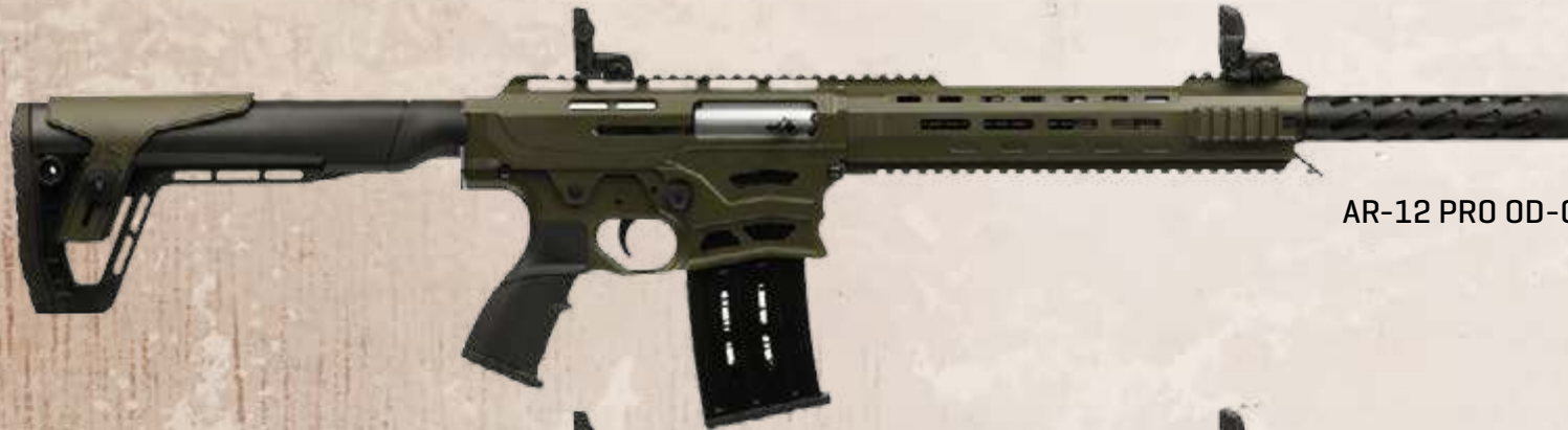
AR-12 PRO OD-GREEN