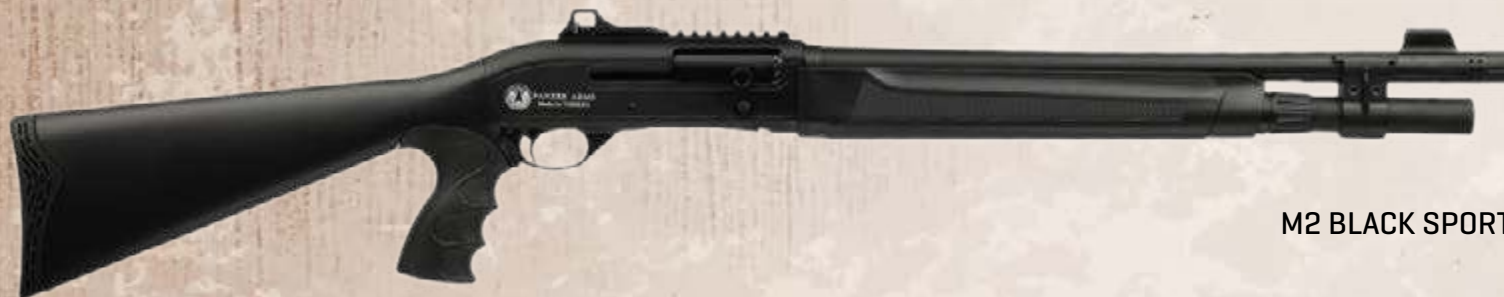
M2 BLACK SPORT