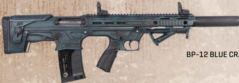
BP-12 BLUE CRA