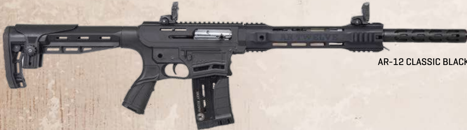
AR-12 CLASSIC BLACK