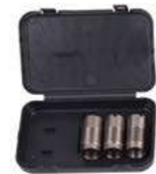
MOBILE CHOKE and BOX