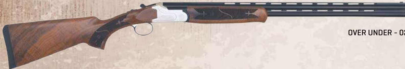
OVER UNDER - 02