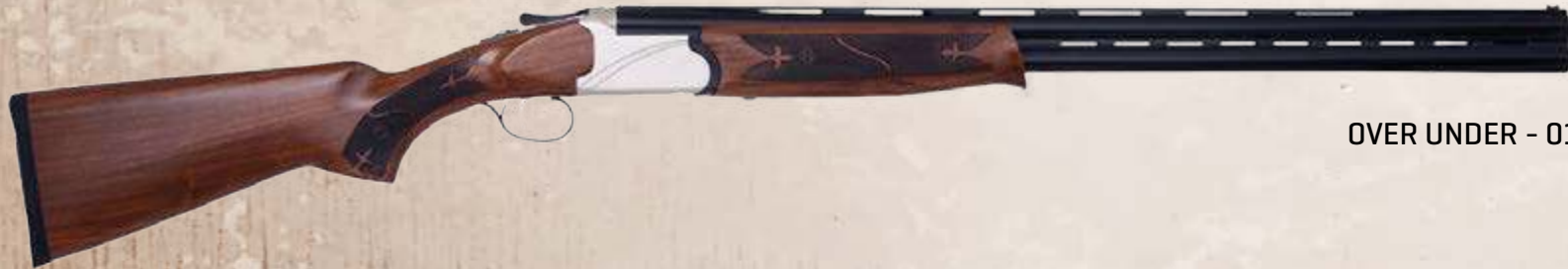
OVER UNDER - 01