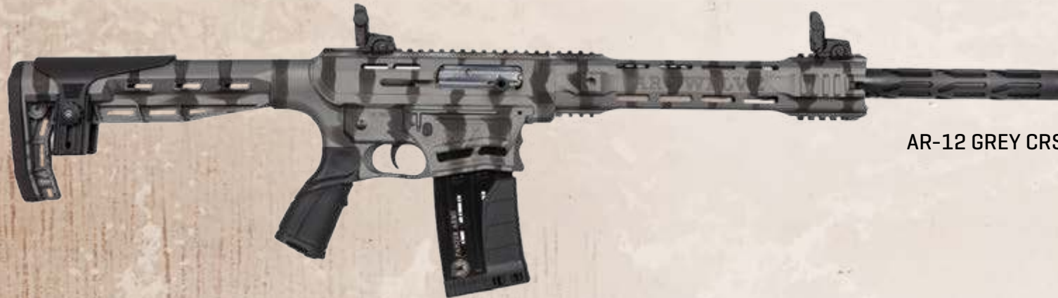
AR-12 GREY CRS