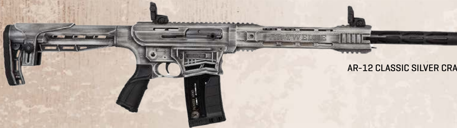
AR-12 CLASSIC SILVER CRA