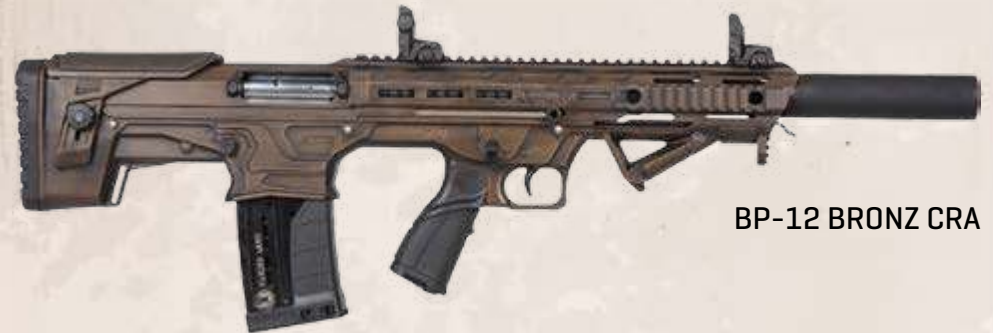
BP-12 BRONZ CRA