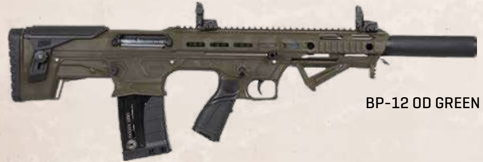
BP-12 OD GREEN