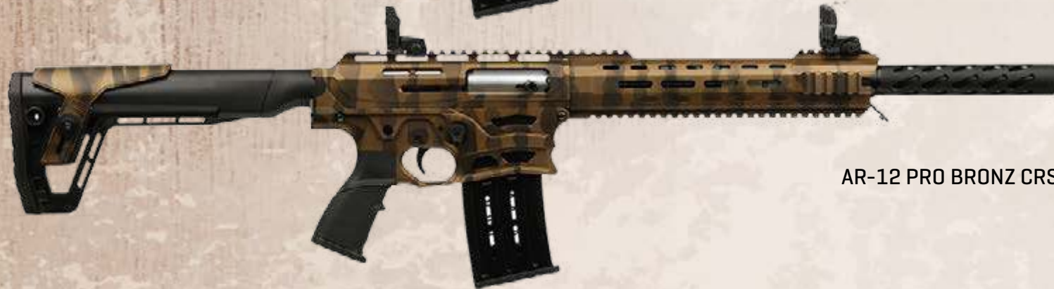
AR-12 PRO BRONZ CRS