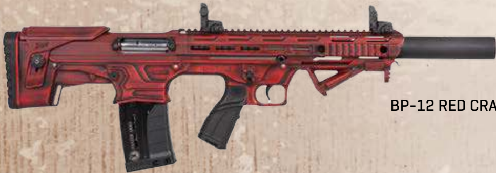
BP-12 RED CRA