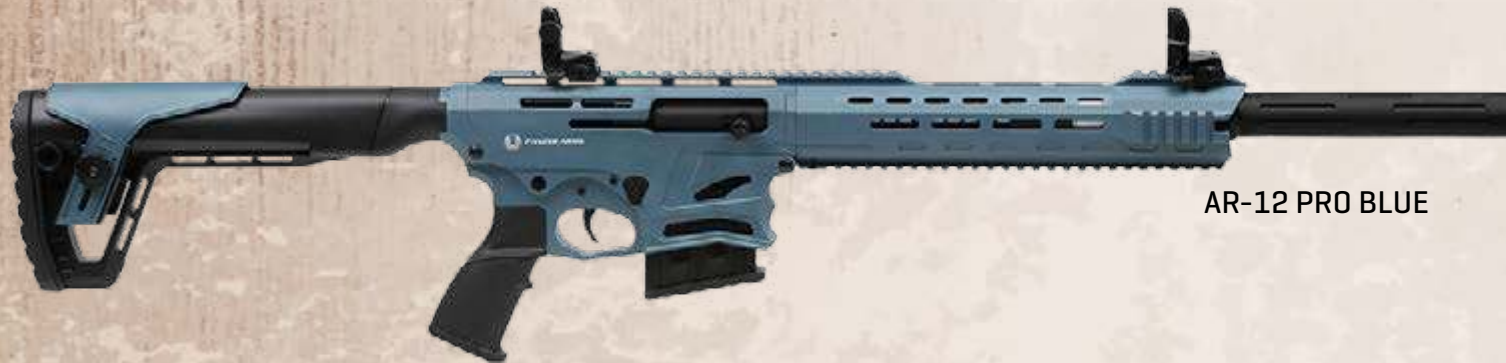
AR-12 PRO BLUE