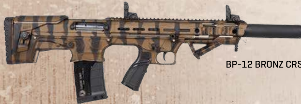
BP-12 BRONZ CRS