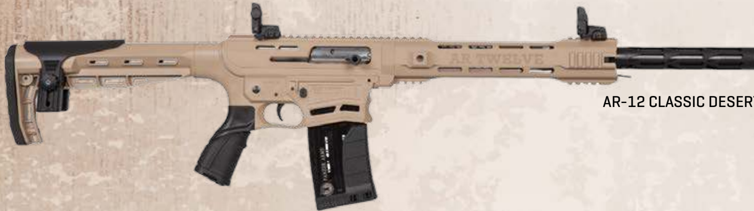
AR-12 CLASSIC DESERT