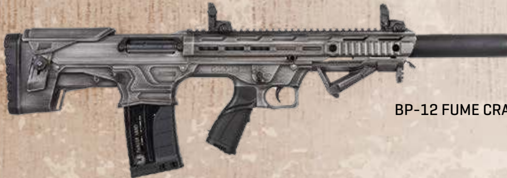
BP-12 FUME CRA