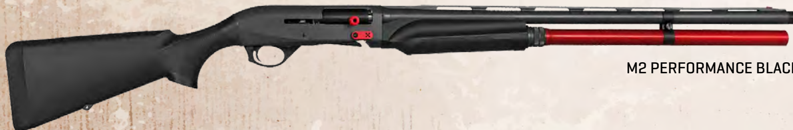
M2 PERFORMANCE BLACK