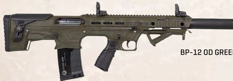
BP-12 OD GREEN