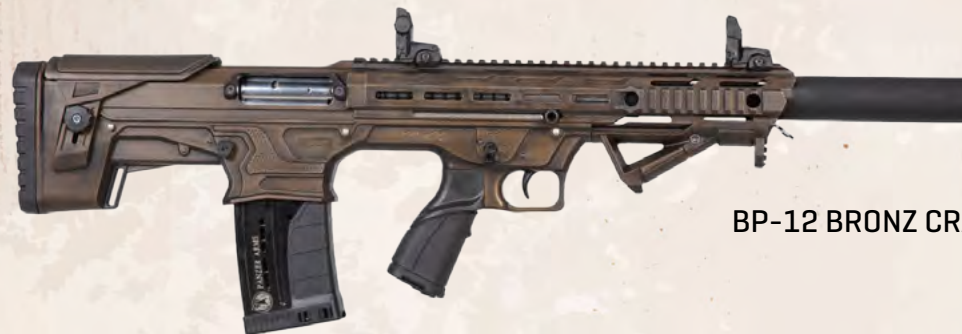
BP-12 BRONZ CRA