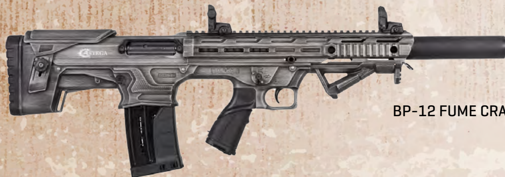
BP-12 FUME CRA