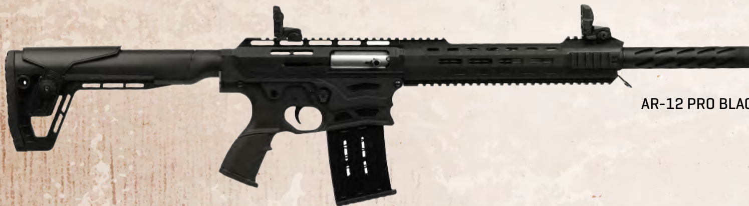
AR-12 PRO BLACK