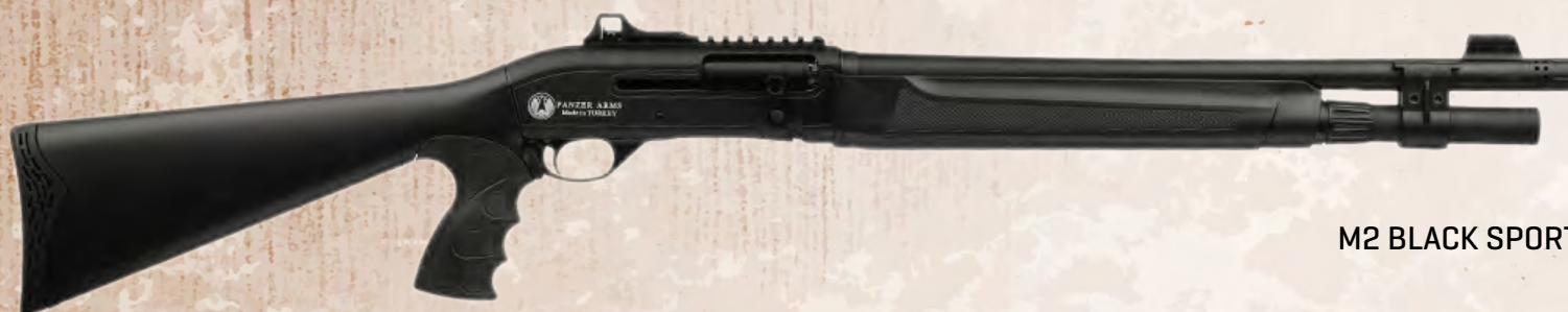
M2 BLACK SPORT