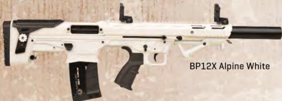
BP12X Alpine White