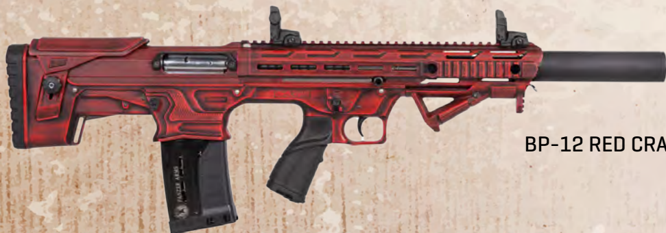
BP-12 RED CRA