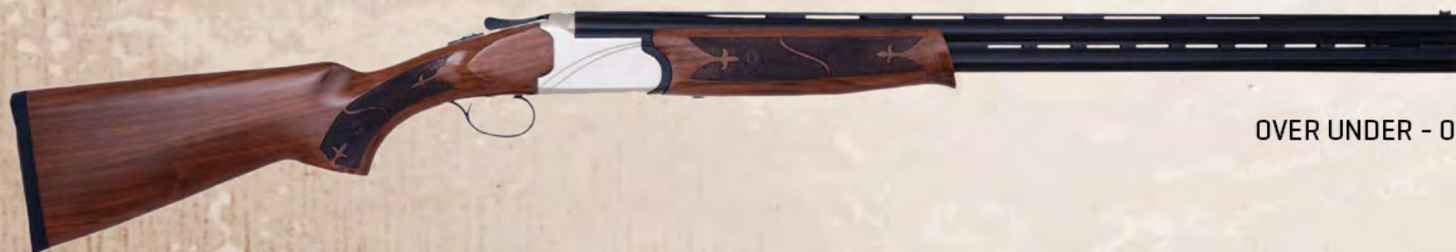
OVER UNDER - 01