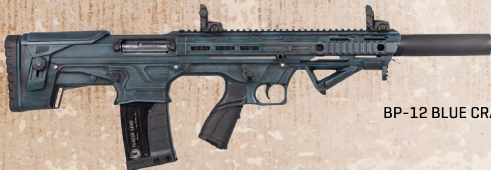
BP-12 BLUE CRA