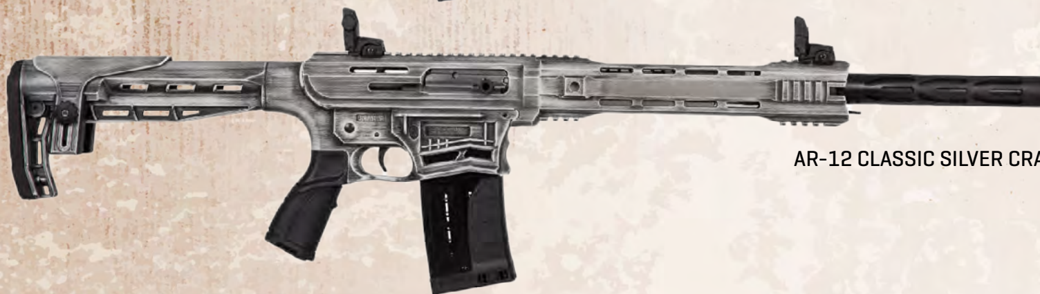
AR-12 CLASSIC SILVER CRA