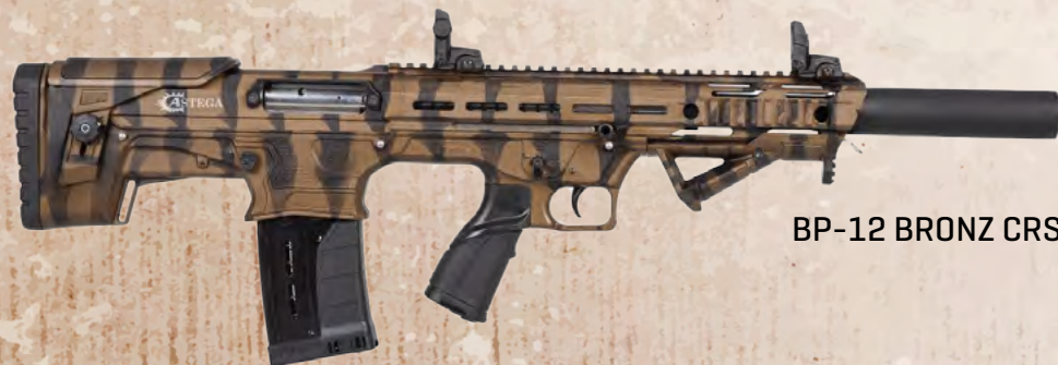
BP-12 BRONZ CRS