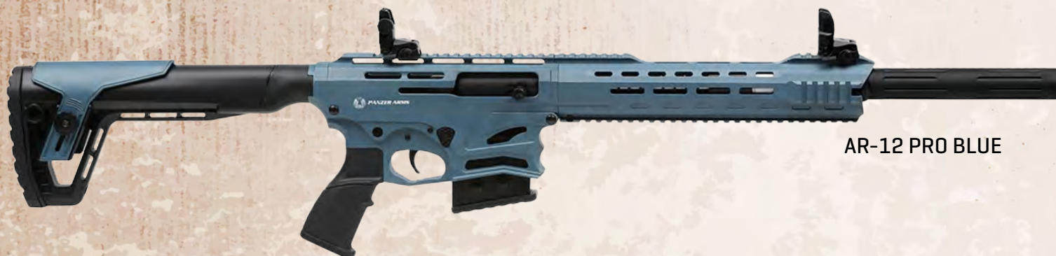
AR-12 PRO BLUE