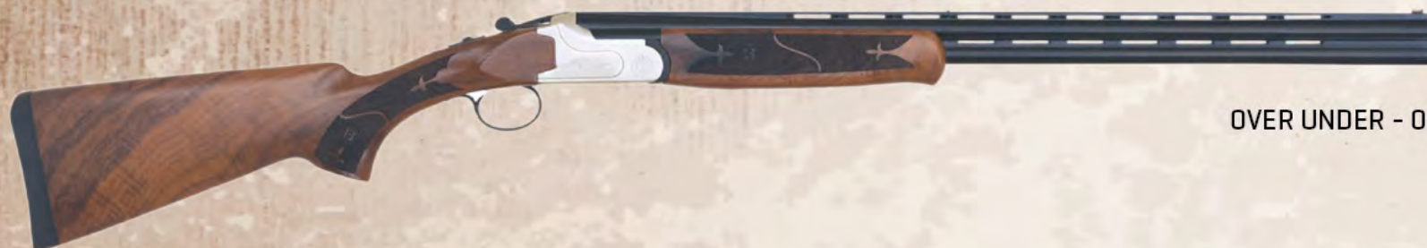
OVER UNDER - 02