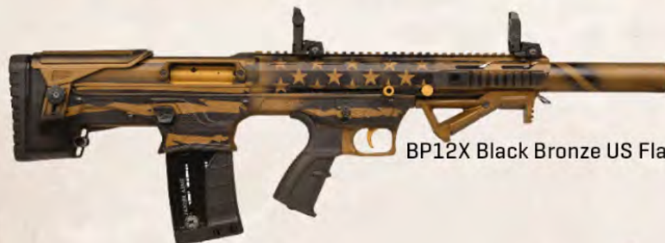
BP12X Black Bronze US Flag