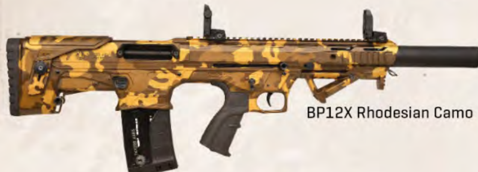
BP12X Rhodesian Camo