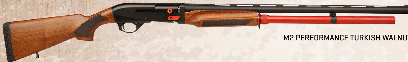
M2 PERFORMANCE TURKISH WALNUT