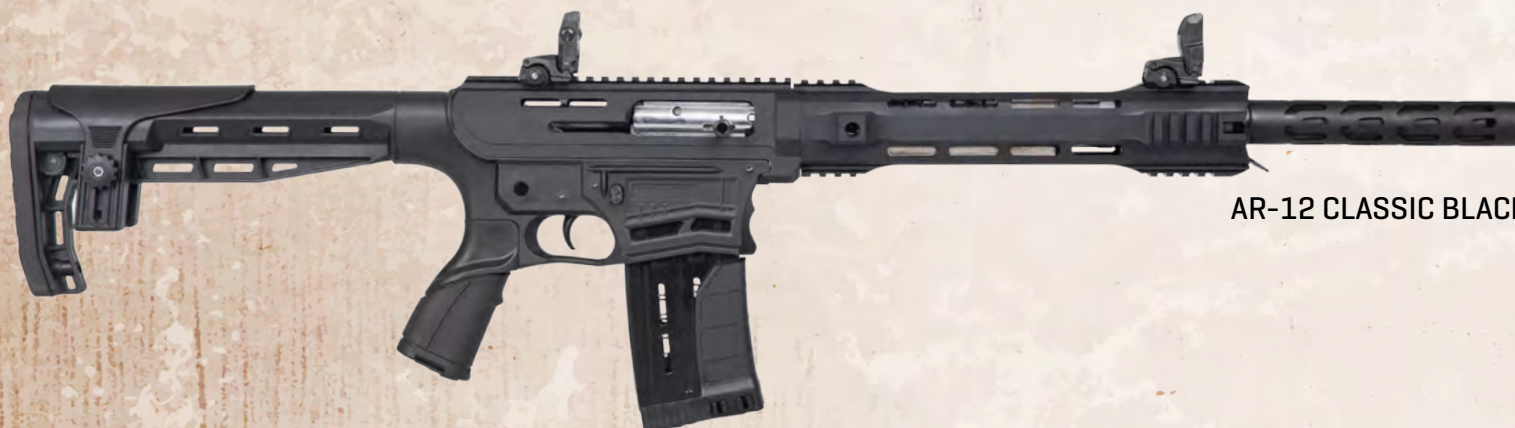
AR-12 CLASSIC BLACK