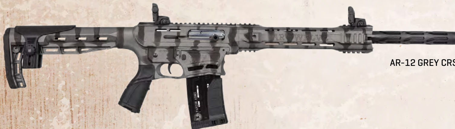
AR-12 GREY CRS