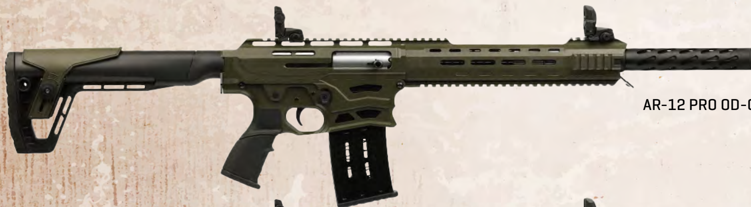
AR-12 PRO OD-GREEN