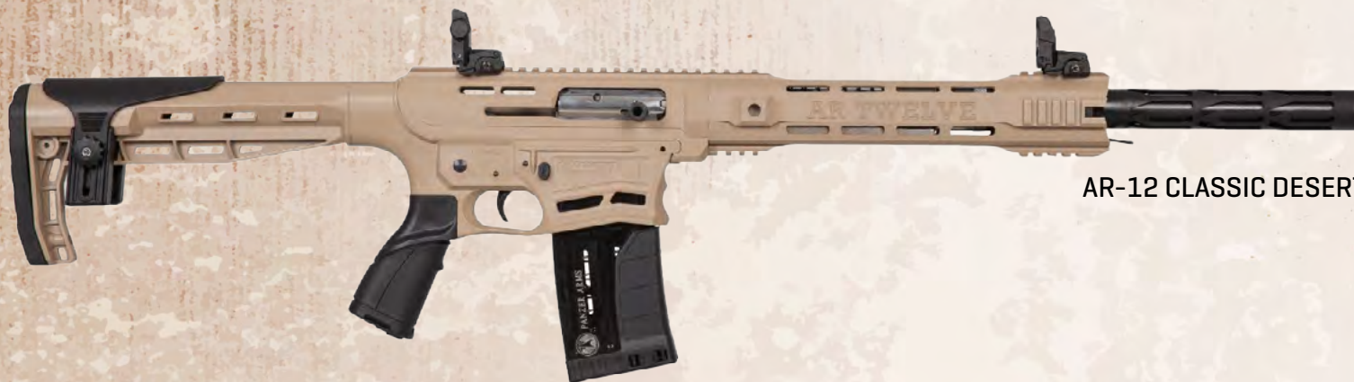
AR-12 CLASSIC DESERT