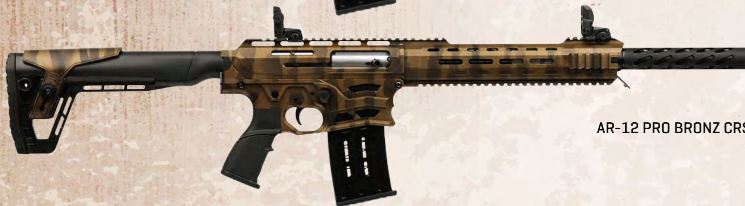
AR-12 PRO BRONZ CRS